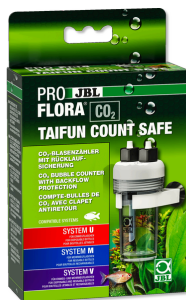
JBL PROFLORA CO2 TAIFUN COUNT SAFE CO2 bubble counter with built-in check valve