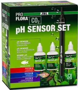
JBL PROFLORA CO2 pH SENSOR SET pH electrode, labor. quality for almost all pH devices