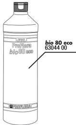
JBL bio80 eco reaction bottle