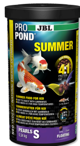
JBL PROPOND SUMMER S Summer food for small koi