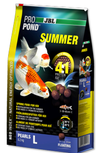
JBL PROPOND SUMMER L Summer food for large koi