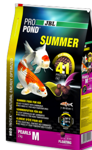
JBL PROPOND SUMMER M Summer food for medium-sized koi