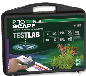
JBL Testlab ProScope Test case for water analysis in plant aquariums