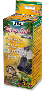
JBL TempSet basic Installation kit for lamps in terrariums