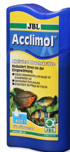
JBL Acclimol Water conditioner for acclimatisation