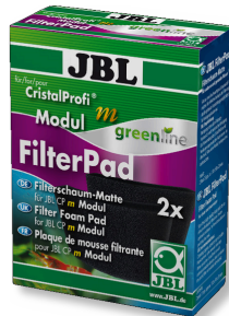
JBL CP m greenline FilterPad module

Spare sponge for CristalProfi m internal filter