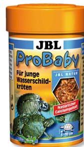
JBL ProBaby Special food for young turtles