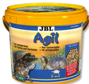
JBL Agil Main foodsticks for turtles 10 – 50 cm in size