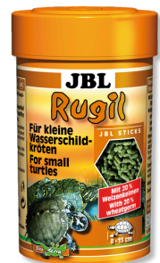
JBL Rugil Food sticks for small turtles