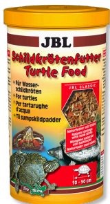
JBL Turtle Food Main food with crayfish for turtles