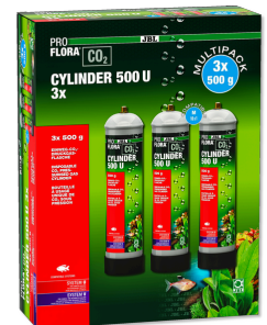
JBL PROFLORA CO2 CYLINDER 500 U 3x

Disposable storage cylinder ready-filled with 500g CO2