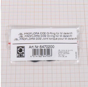
JBL PROFLORA CO2 O- ring for m