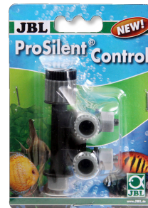
JBL ProSilent Control