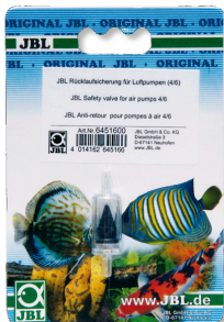
JBL backflow protection