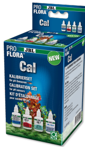
JBL PROFLORA Cal Complete kit for calibration