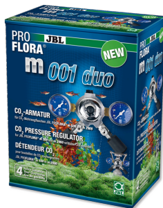
JBL PROFLORA m001 duo Fitting to reduce pressure for 2 CO2 diffusers