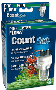
JBL PROFLORA CO2 Count Safe Bubble counter with backflow stop