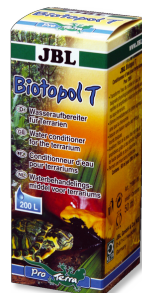
JBL Biotopol T Water conditioner for terrariums