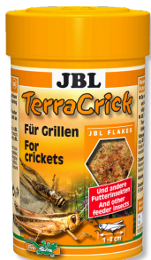
JBL TerraCrick Complete food for feeder insects