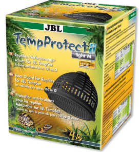
JBL TempProtect II light Reptile thermal burn protection for JBL TempSet items