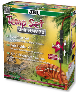
JBL TempSet Unit L-U-W Installation kit for metal-halide lamps