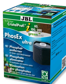
JBL PhosEx Ultra CristalProfi i60/80/100/200

Filter insert with activated carbon for CP i range