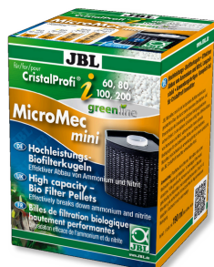
JBL MicroMec CristalProfi i60/80/100/200

High-performance filter balls for CristalProfi i