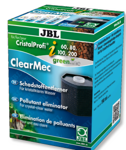
JBL ClearMec CristalProfi i60/80/100/200

Phosphate remover cartridge for JBL CristalProfi i