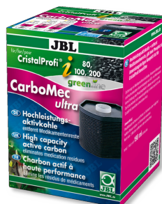
JBL CarboMec ultra Pad CristalProfi i60/80/100/200

High-performance filter balls for CristalProfi i