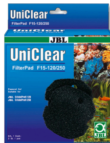
JBL FilterPad F15 Coarse foam pad for aquarium filter CristalProfi