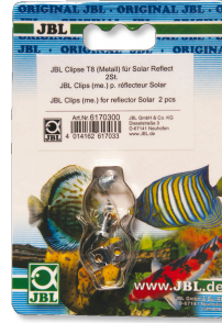
JBL Clips T5/T8 (Metal) Metal holder für fluorescent tubes