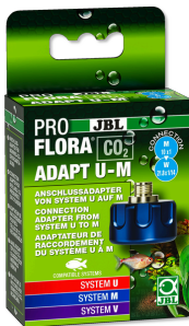
JBL PROFLORA CO2 ADAPT U - M CO2 conversion adapter disposable to refillable bottle