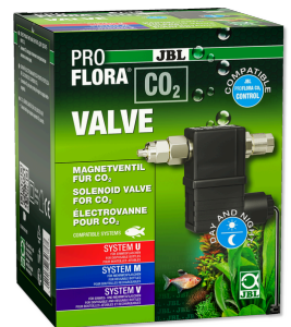
JBL PROFLORA CO2 VALVE CO2 solenoid valve for regulated CO2 addition