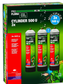
JBL PROFLORA CO2 CYLINDER 500 U 3x 500g disposable CO2 storage cylinder (value pack of 3)