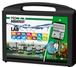
JBL PROAQUATEST LAB Test case with 13 water tests for freshwater analysis