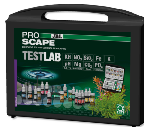
JBL PROAQUATEST LAB PROSCAPE Test case for water analysis in plant aquariums