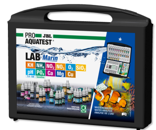
JBL PROAQUATEST LAB Marin Professional test case for marine water analysis