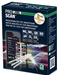
JBL PROSCAN Water test with analysis via smartphone