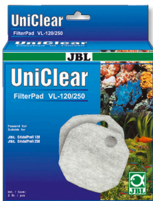
JBL FilterPad VL Cotton fleece for CristalProfi aquarium filters