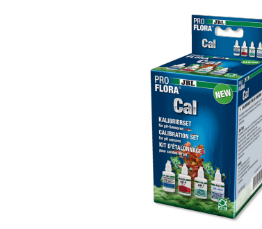
JBL PROFLORA Cal Complete kit for calibration