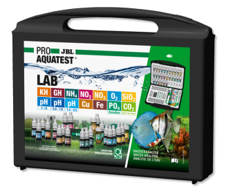
JBL PROAQUATEST LAB

Test case with most important water tests + NH4 test