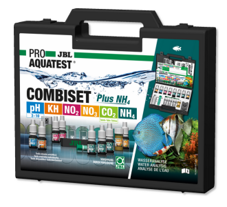
JBL PROAQUATEST COMBISET Plus NH4

Test case with most important water tests + iron test