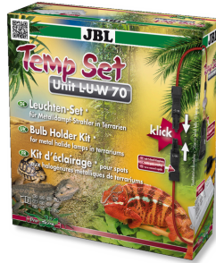
JBL TempSet Unit L-U-W Installation kit for metal-halide lamps