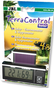
JBL TerraControl Solar Solar-powered thermometer + hygrometer for terrariums