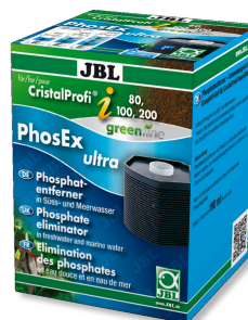
JBL PhosEx Ultra CristalProfi i60/80/100/200

Filter insert with activated carbon for CP i range