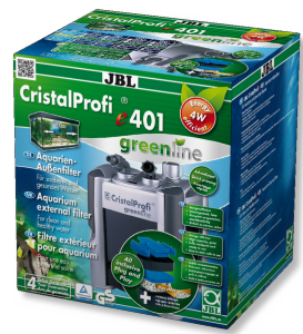
JBL CristalProfi e401 greenline

External filter for aquariums from 200 - 700 litres