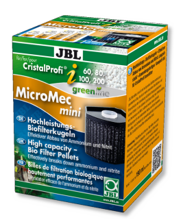
JBL MicroMec CristalProfi i60/80/100/200

High-performance filter balls for CristalProfi i