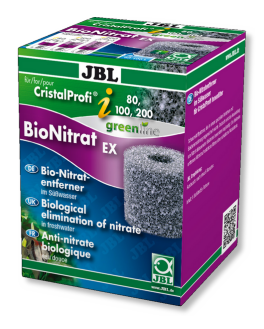
JBL BioNitrat Ex CristalProfi i60/80/100/200

Active peat granulate for CristalProfi i