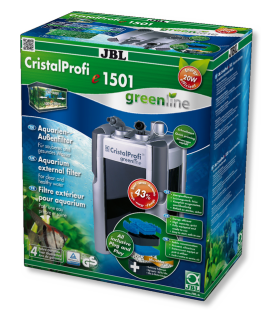
JBL CristalProfi e1501 greenline

External filter for aquariums from 90 - 300 litres