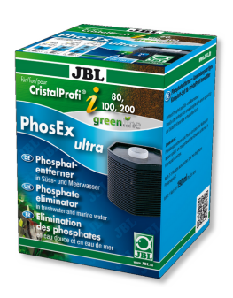
JBL PhosEx Ultra CristalProfi i60/80/100/200

Filter insert with activated carbon for CP i range