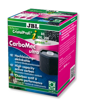
JBL CarboMec ultra Pad CristalProf i60/80/100/200

High-performance filter balls for CristalProfi i