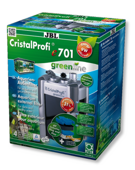
JBL CristalProfi e701 greenline

External filter for aquariums from 60 - 200 litres