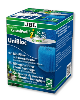
JBL UniBloc CristalProfi i60/80/100/200 Foam cartridge for Cristal Profi