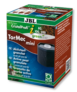
JBL Tormec CristalProfi i60/80/100/200

Nitrite, nitrate and phosphate eliminator for CP i