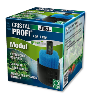
JBL CRISTALPROFI i greenline module

Water outlet with wide jet pipe for internal filters