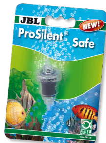
JBL ProSilent Safe