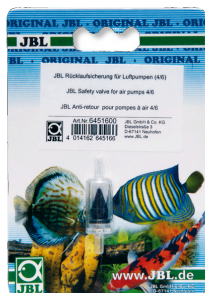
JBL backflow protection