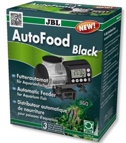
JBL AutoFood BLACK Black automatic feeder for aquarium fish