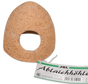
JBL Ceramic spawning cave Ceramic cave for freshwater aquariums