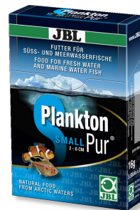
JBL PlanktonPur SMALL Treats for small aquarium fish