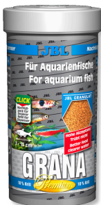
JBL Grana Premium main food granulate for small aquarium fish