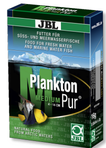
JBL PlanktonPur MEDIUM Treats for large aquarium fish