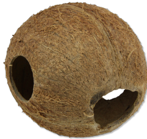
JBL Cocos Cava Coconut cave for aquariums and terrariums