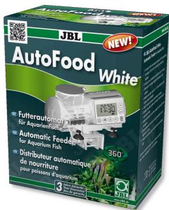
JBL AutoFood WHITE White automatic feeder for aquarium fish