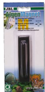
JBL Algae Magnet Magnetic glass cleaner for aquarium panes