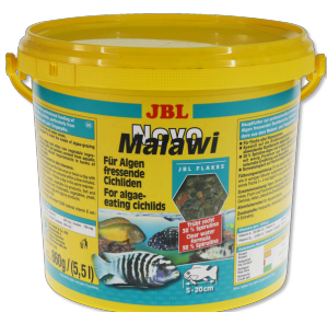
JBL NovoMalawi Main food flakes for algae-eating cichlids