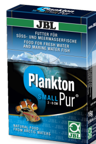
JBL PlanktonPur SMALL Treats for small aquarium fish