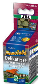
JBL NanoTabs Main food for shrimp and dwarf crayfish