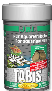
JBL Tabis Premium food tablets for freshwater and marine fish