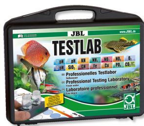
JBL Testlab Test case with 13 tests f. freshwater analysis Testlab