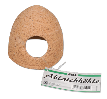
JBL Ceramic spawning cave Ceramic cave for freshwater aquariums