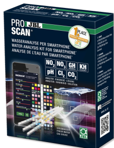
JBL PROSCAN Water test with analysis via smartphone