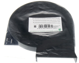
JBL PP AUTOFOOD feed ejection cover below