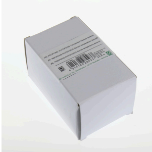
JBL PP AUTOFOOD temperature sensor