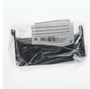
JBL PP AUTOFOOD ejection port rain cover