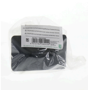
JBL PP AUTOFOOD mesh guard screw conveyor