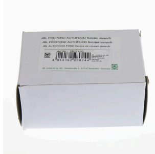
JBL PP AUTOFOOD power supply unit