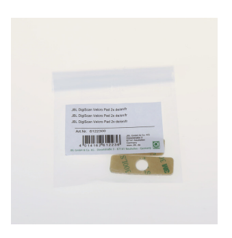
JBL DigiScan Velcro Pad, 2x