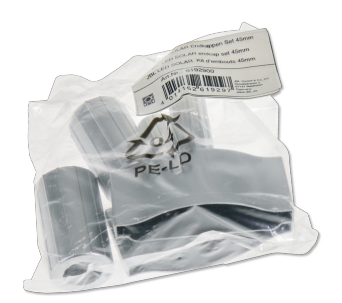
JBL LED SOLAR end cap