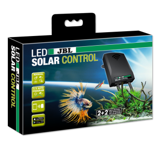
JBL LED SOLAR CONTROL Control unit for JBL LED SOLAR lights