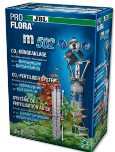
JBL PROFLORA m502 CO2 plant fertiliser system with night switch-off