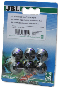
JBL slotted suction cup, 2mm

Holder for heating cables in aquariums and terrariums