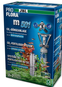
JBL PROFLORA m501 CO2 plant fertiliser system complete kit