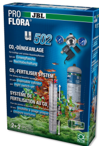
JBL PROFLORA u502 Plant fertiliser system with night switch-off