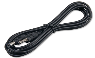
JBL pH Control Touch connection cable