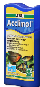
JBL Acclimol Water conditioner for acclimatisation