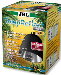
JBL TempReflect light Reflector screen for energy-saving lamps