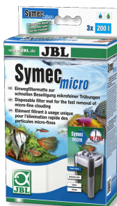
JBL Symec micro Microfibre fleece against water cloudiness