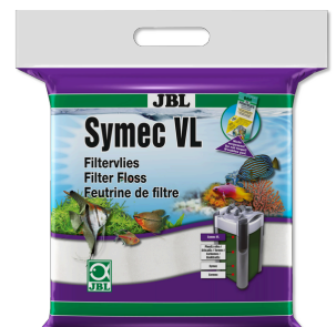
JBL Symec VL Filter wool fleece to remove water cloudiness