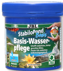
JBL StabiloPond Basis Basic care product for all garden ponds