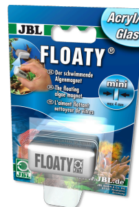
JBL FLOATY acrylic/glass Floating acrylic pane cleaning magnet