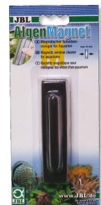
JBL Algae Magnet Magnetic glass cleaner for aquarium panes