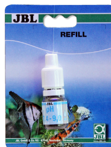
JBL pH Test 7.4-9.0 pH test in aquariums and ponds in the range 7.4-9.0