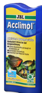
JBL Acclimol Water conditioner for acclimatisation