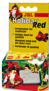
JBL Holiday Red Complete holiday food for goldfish