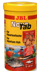
JBL NovoTab Main food tablets for all aquarium fish