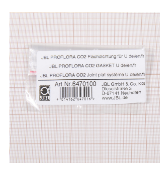
JBL PF CO2 flat gasket for u